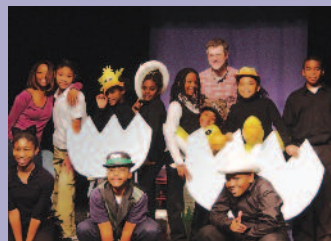
Stages St. Louis