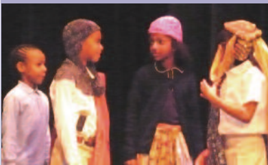
Shakespeare Festival of St. Louis