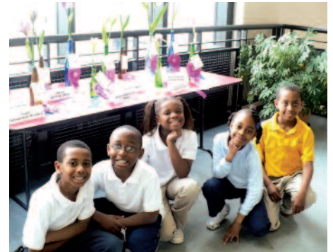
Iris contest winners