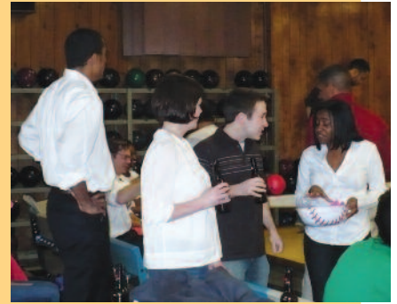
Friends enjoying the bowling event!

In March, City Academy's Friends Committee hosted its first annual Spring Bowling Extravaganza at Saratoga Lanes in Maplewood. Attendees enjoyed bowling, darts, pool, a silent auction, and great music, in addition to tasty refreshments!